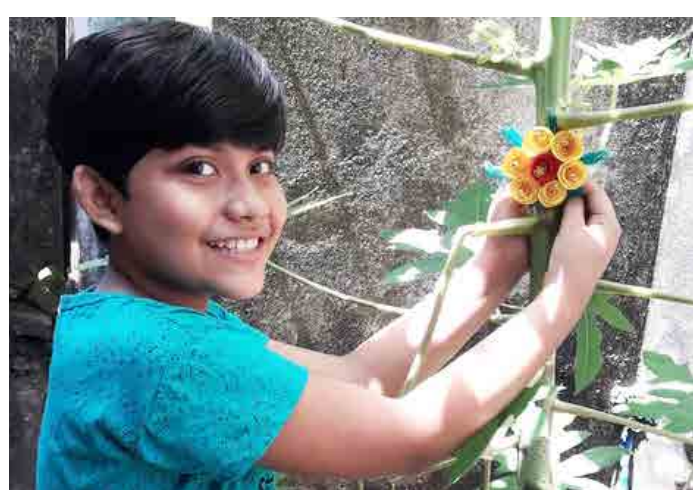
Raksha Bandhan With Nature