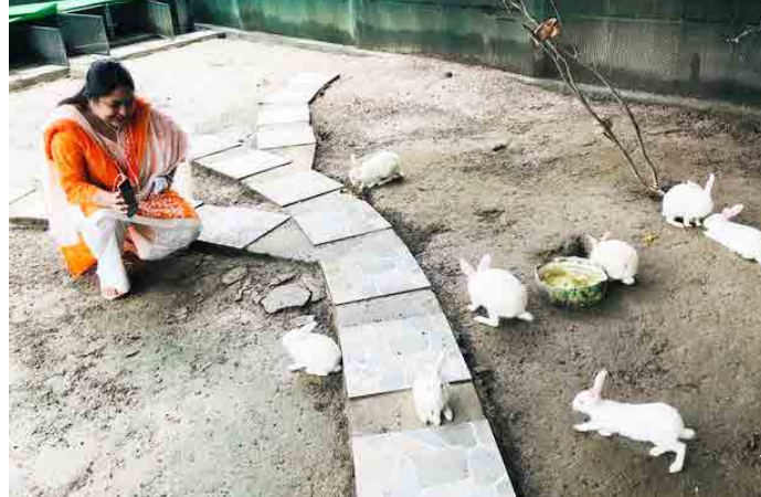
Virtual Tour of SIS